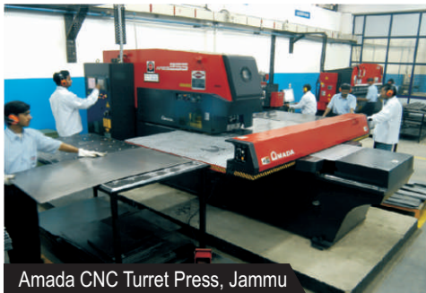
Amada CNC Turret Press, Jammu

Our promptness, efficiency and world class technology is our hallmark shared by the after sales team. Reason why, we have one of the largest repeat-order customer base.