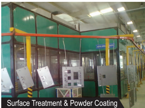
Surface Treatment & Powder Coating