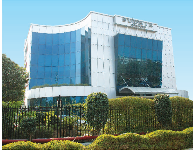
Corporate Office, Gurgaon