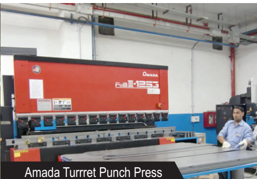
Amada Turret Punch Press