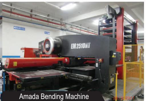
Amada Bending Machine